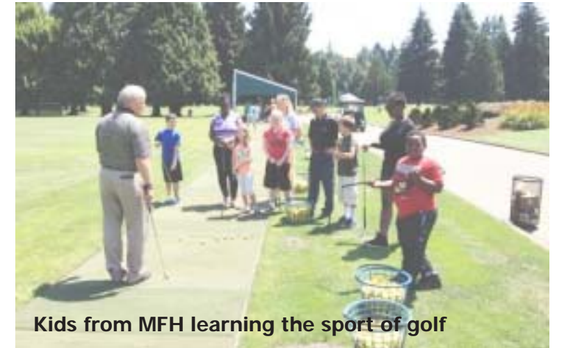
Kids from MFH learning the sport of golf